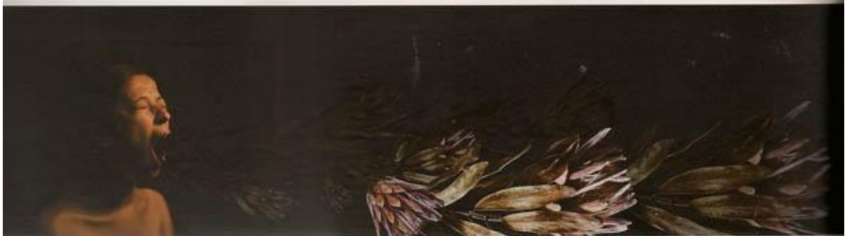
| Gabriela Goleth, Bouquet III, 2007, Archival Print (tricolor), Edition of 5, 1300 x 260 cm